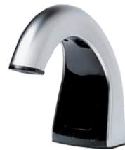
ESD Deck Mounted Electronic Soap Dispenser