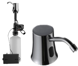
SD-E Deck Mounted Electronic Soap Dispenser