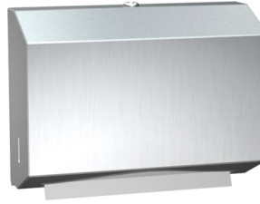
TD-L Wall/Backsplash Mounted Mini Towel Dispenser. Holds (275) Multi-Fold or (200) C-Fold Paper Towels. Includes Lock & Key.

➤ Use w/ Any Sink ➤ Overall Size: 11" x 8" x 4"