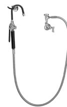
CMS Pot Filler Includes Pot Filler Valve, Vacuum Breaker & 3-Ply Hydraulic Hose