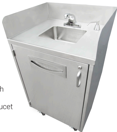
PHS Shown with Optional Electronic Faucet (EFD-2D)