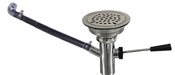
LDO-2 Lever Drain w/ Overflow

▶ Changes Drain Size to 3½" ID ▶ Voids ADA Compliance