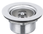
HSS-T Hand Sink Strainer