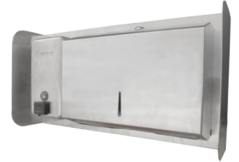
ITSD-2 Soap & Towel Dispenser. Unit to Be Mounted above any IMC/Teddy Sink. Includes Lock & Key.