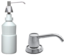
SD Deck Mounted Integral Soap Dispenser