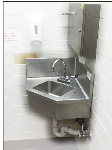
Model #WS-CK w/ ITSD