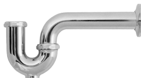
T "P" Trap