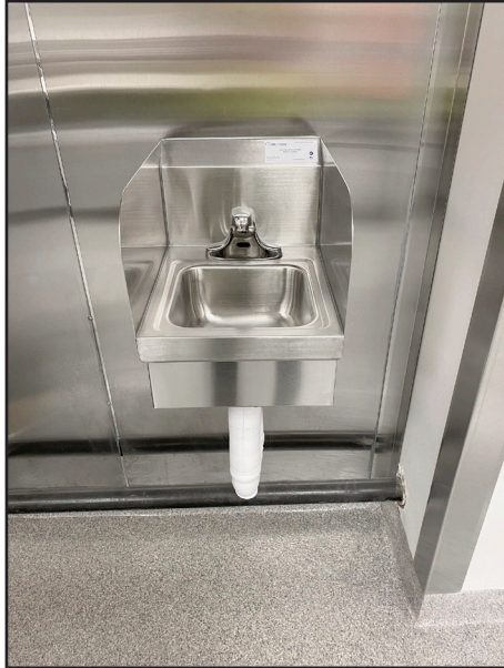
Model #CSW w/ Side Splashes & EFD-2D Electronic Faucet