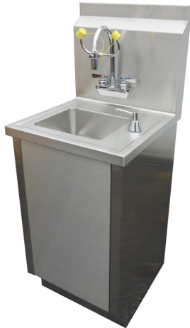
HS Shown w/ Optional (EW-S) Eye Wash Faucet