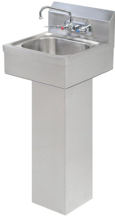
CSF Shown w/ Standard Faucet