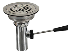
LD-2 Lever Drain

▶ Changes Drain Size to 3½" ID ▶ Voids ADA Compliance