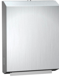
TD-B Wall/Backsplash Mounted Towel Dispenser. Holds (525) Multi-Fold or (400) C-Fold Paper Towels. Includes Lock & Key.