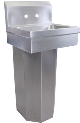
CSO-X Faucet Not Included