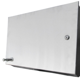
ITSD Integrated Combination Towel & Soap Dispenser. Unit To Be Wall Mounted Above IMC/ Teddy Hand Sink. Includes Lock & Key.