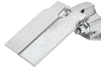
KNV-2 Double Knee Valve & Gooseneck Spout