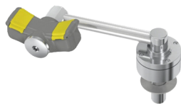
EW-U Universal Mounted Eye Wash Station. Mount in Place of ITD.