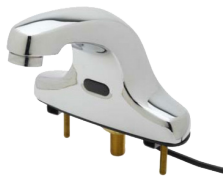
EFD-2D 4" OC Electronic Deck Mounted Integral Spout Faucet

*Upgrade RGLH faucet to equal T&S, Fisher or Chicago - specify model #.