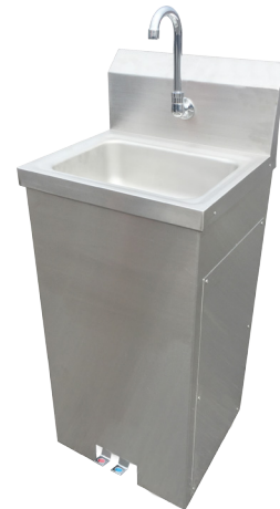
CSB Shown here with Optional Electronic Faucet (EFD-1SG) & Foot Pedal Valve (FPV)