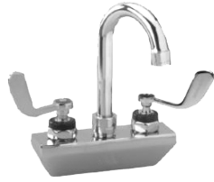
RGLH-S Splash Mounted 4" OC Gooseneck Faucet w/ Wrist Handles