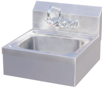
CSW-2S Shown w/ Standard Faucet