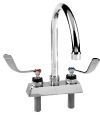
RGLH-D Deck Mounted 4" OC Gooseneck Faucet w/ Wrist Handles