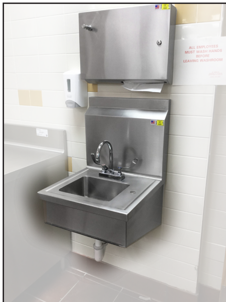
Model #WS-2S w/ ITSD