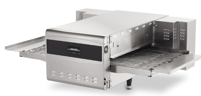
THE CONVEYOR C2600