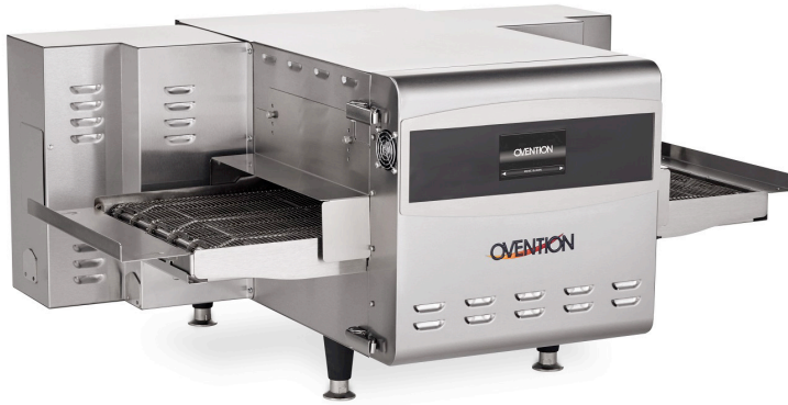
THE CONVEYOR C1400

† Ventless certification is for all food items except for foods classified as "fatty raw proteins". Such foods include bone-in, skin-on chicken, raw hamburger meat, raw bacon, raw sausage, steaks, etc. If cooking these types of foods, consult local HVAC codes and authorities to ensure compliance with ventilation requirements. Ultimate ventless allowance is dependent upon AHJ approval, as some jurisdictions may not recognize the UL certification or application. If you have questions regarding ventless certifications or local codes, please email connect@ventionovens.com .